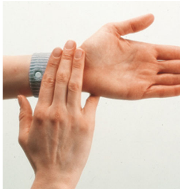
Fig. 1 The localization of the point PC6 Neiguan and the correct positioning of the Sea-Bands ®

The patients were asked to document a total of six migraine attacks: three without the use of the Sea-Band ® wristbands (phase C, control) and three with the application of the Sea-Bands ® (phase SB). The sequence of the treatment given for the attacks (with, or without Sea-Bands ® ) was chosen at random according to a scheme provided by the computer and was applied to each single patient.